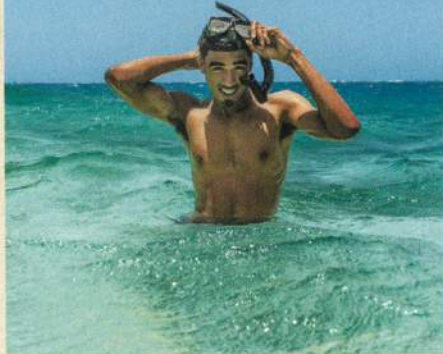
Hol Chan Marine Reserve