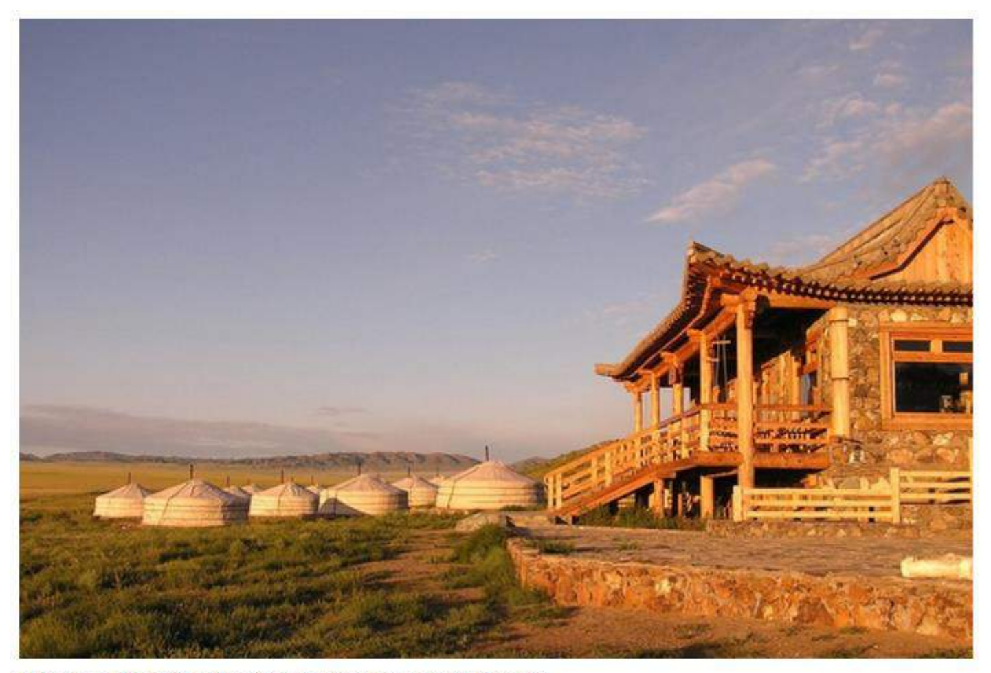
Three Camel Lodge, a Nomadic Expeditions retreat in Mongolia.